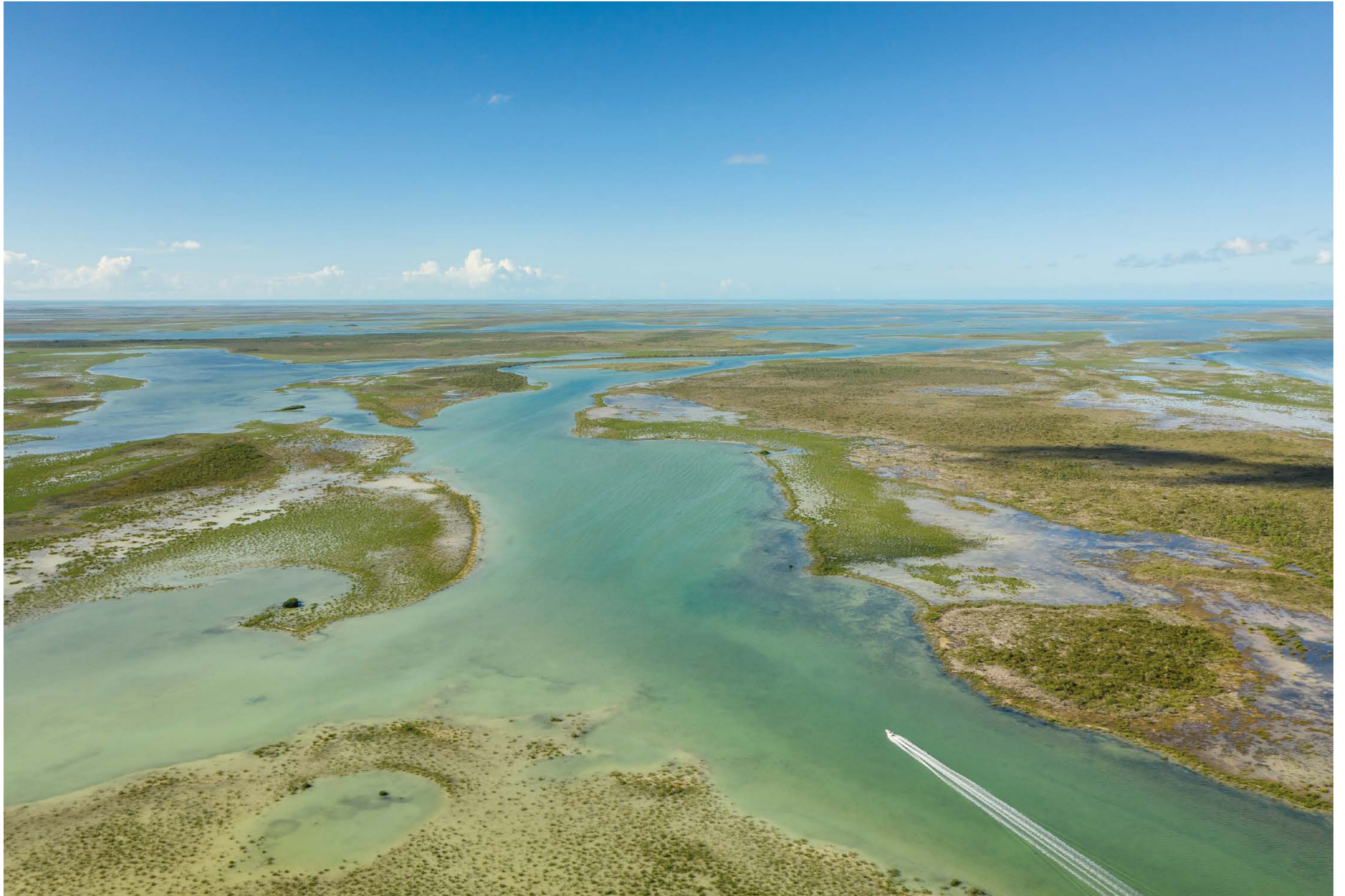
The lodge is a five-minute skiff run north or south to either Deep or Little Creek